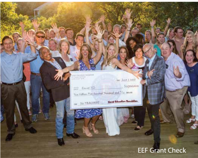
EEF Grant Check

The EANES EDUCATION FOUNDATION is the only organization that can fund additional teacher and staff positions for our district.